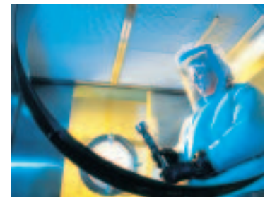
Superior chemical resistance and clarity